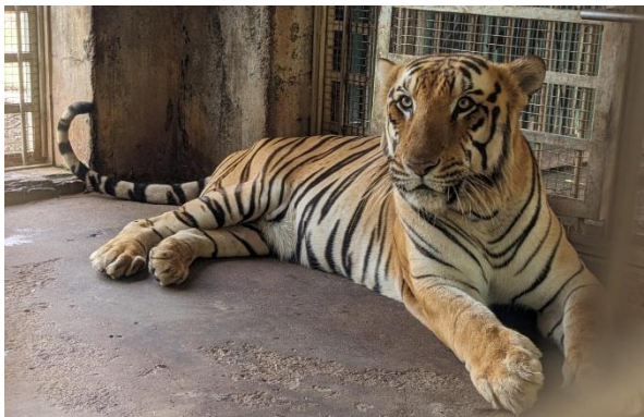
Post-operative day 1, after excision of tumour

animals was unable to be operated for tumour. The tumour mass was surgically excised under gas anesthesia. Multiple perfusing blood vessels of the tumour were cauterized using a vessel sealer for effectively arrest bleeding. Post operatively the Tiger was continuously monitored until it's complete recovery. The tiger was found brisk and more agile on very next day with regular feed intake. Post-operative healing was assessment was monitored with the help of thermal imaging camera. The tumour mass weighed around 1.4kg and on histopathological investigation, it is diagnosed as Fibroma, a benign tumour. The surgical wound healed up completely and animal recovered uneventfully on 12th day of procedure.