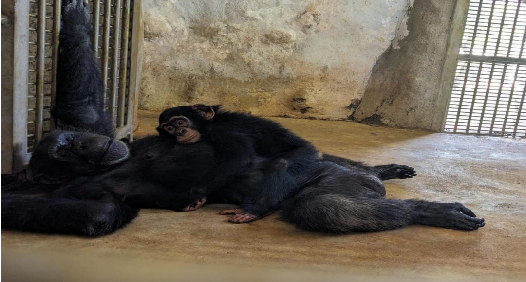
Baby chimp relaxing on mother after her recovery

No bone involvement was noticed in radiograph. Incidentally high blood glucose was found and basic blood analysis. Soon HbA1c was analyzed and found to 16.8 which is very high, Indicating high blood glucose for past 12-22 weeks. Diet was modified immediately and urine glucose was monitored frequently.